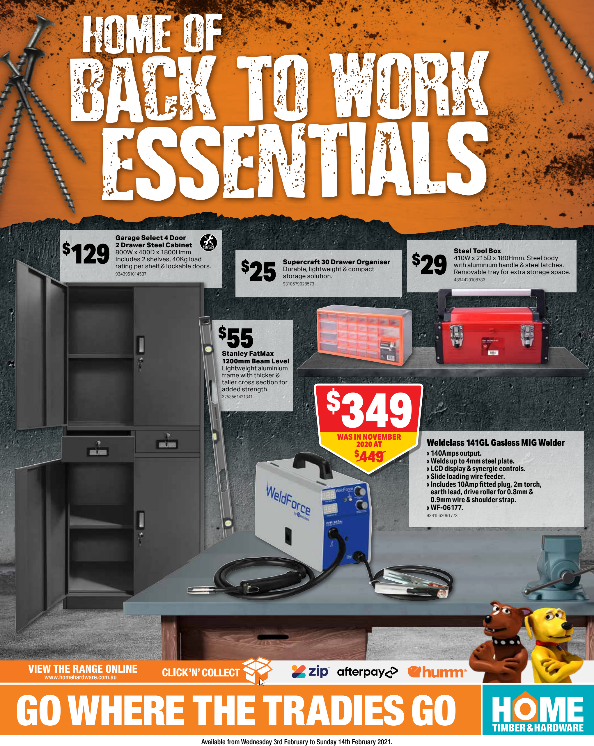
Most products in this catalogue may also be available for order through Click 'n' Collect, visit the website to order and for full terms and conditions. At participating stores only. Prices stated are recommended only & may vary among stores. Please see backpage for details. For payment options, please visit the website.